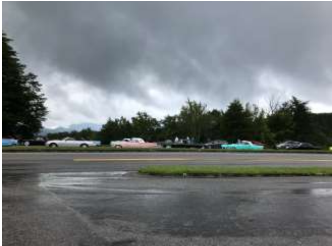
Saturday morning Tour

Friday morning the Judges headed out onto the floor to judge all the beautiful cars (about 150 of them). Finished about 4pm and we had to move the cars back to the hotel parking lot. Saturday morning cars headed out on a cruise of beautiful Tennessee.